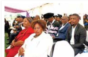
Invited guests following the proceedings