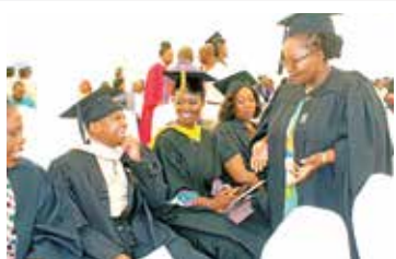
Good Shepherd Catholic College of Health Science lecturers sharing a light moment.