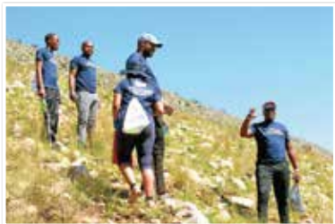
Taking a breather