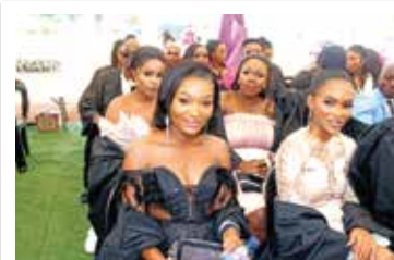
The graduands following the proceedings