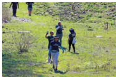
Team members encouraging each other.