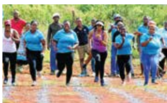
Action during the College's sports day

The Wellness Clinic also encourage staff to take part in other activities such as hiking and marathons.