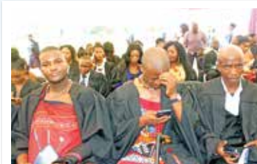
Some graduands came dressed in traditional regalia