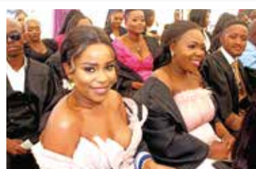
New nurses...graduands looking good during their graduation