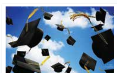
Congratulations to the graduates,,,halala!!!