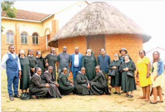
Good Shepherd Catholic Hospital and College of Health Sciences is situated in the historic town of Siteki in the Lubombo Region of