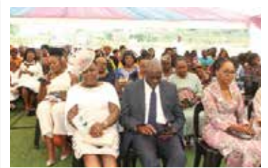
Proud parents, friends and relatives came in their numbers to celebrate the milestone.