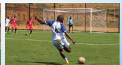
Waiting for a cross to be delivered