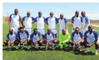
Good Shepherd Catholic Hospital & College of Health Sciences soccer team