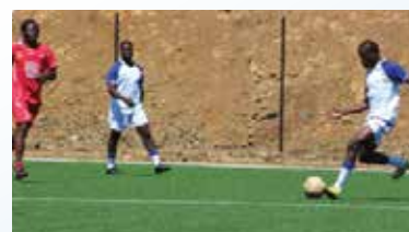
Good Shepherd players in action during a social tournament