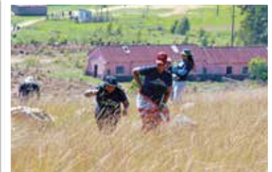
It always seems hard until its done.